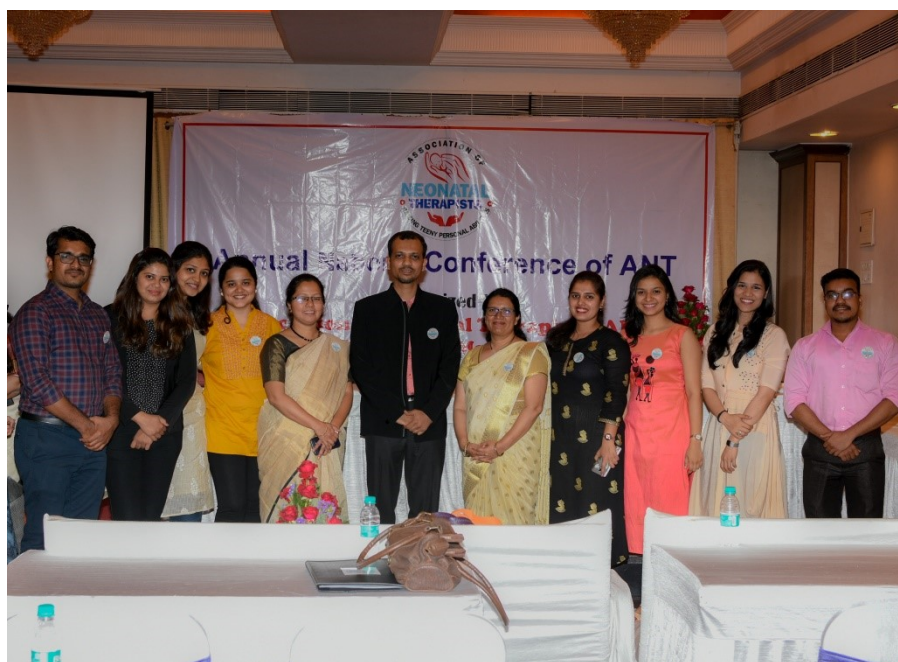
FOUNDER MEMBERS OF ASSOCIATION OF NEONATAL THERAPISTS