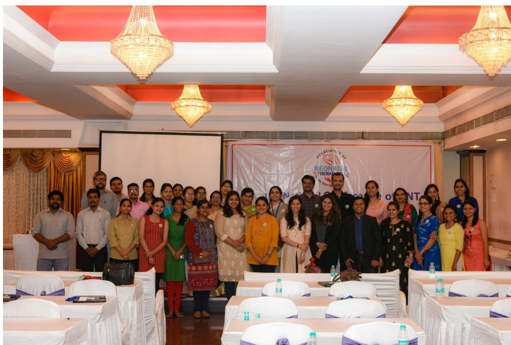
DELEGATES OF THE 1ST ANT CONFERENCE